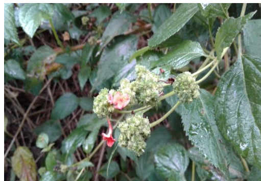
Figure 4. Damage caused by the lantana flower gall mite, Aceria lantanae

Other damaging lantana biocontrol agents in Australia, include the gall-forming bud mite - Aceria lantanae (Cook) (Figure 4), the leaf-mining flies - Calycomyza lantanae (Frick) and Ophiomyia camarae Spencer, a defoliator moth - Hypena laceratalis (Walker) and the pathogenic rust - Prospodium tuberculatum (Speg.) Arthur.