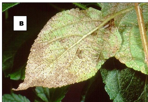
Figure 1 (A) Lantana lace bug- Teleonemia scrupulosa (B) Leaf damage caused by T. scrupulosa