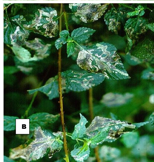
Figure 2 (A) Lantana leaf-mining beetle Uroplata girardi (B) Leaf damage caused by U. girardi