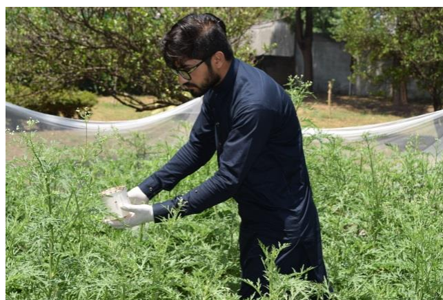
Fig. 2. Collection and multiplication of Zygogramma beetle at research facility.