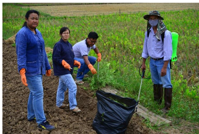
Fig. 3. Eradication of parthenium weed from agricultural area in Lamphoon Province, Northern Thailand using chemical (above) and physical (below) management.