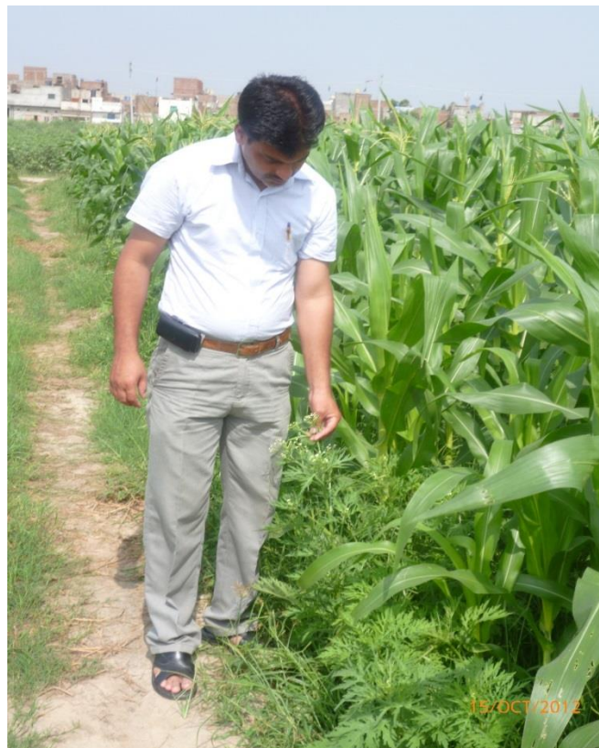
Fig. 1. Parthenium growing in maize experimental field in Faisalabad, Pakistan.

For biochemical control of parthenium weed, herbicidal potential of commonly growing herbaceous plants and leaves of tree species were explored and tested against the germination and seedling growth of parthenium weed. It was revealed that the maximum suppression of germination (95 and 79%) and seedling biomass (96 and 97%) of parthenium weed was caused by a 5% leaf extract of A. aspera and R. communis , respectively, possibly due to phenolic compounds (gallic, caffeic, chromatotropic, p -coumaric, m -coumaric, syringic and 4-hydroxy-3-methoxy benzoic acids) detected in them. The competition studies conducted in field showed that significant reduction in grain yield of maize was observed with parthenium density of five plants per m 2 and parthenium competition period of 5 weeks after crop emergence, therefore considered to be critical for control of this weed.