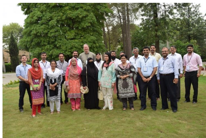
Fig. 1. The participants of stakeholders' workshop Islamabad May 2017.

A knowledge sharing workshop on parthenium weed in Pakistan was organised by CABI in May 2017 and sponsored by the UK's Department for International Development (DFID). CABI's new invasive species programme, Action on Invasives, dedicated to developing regional, national and local coordinated approaches to invasive species, delivered various background materials. The workshop's objectives were to share experiences and information on parthenium weed's invasion and impacts in the country and finalise an initial comprehensive action plan in the short, medium and long term. It is worth noting that parthenium weed was chosen as a proof of concept: the invasive species programme will aim to consult with all stakeholder to assess which other invasive species should be included in the future as the programme develops. The Executive Director of the Inspectorate General of Forests and representatives from Quarantine Departments, Research Institutes (including National Agricultural Research Centre and Natural History Museum of Pakistan), Universities (University of the Punjab, Lahore and University of Agriculture, Faisalabad) and the FAO were invited to discuss and contribute towards a national response to the invasive weed Parthenium hysterophorus .