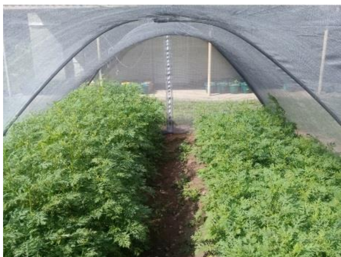
Fig. 2. Walk-in cage at TPRI, Arusha, Tanzania. Zygogramma bicolorata larvae and adults were reared on Parthenium hysterophorus seedlings which were planted directly in the soil.