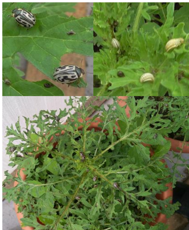
Fig. 1. Zygogramma bicolorata adults (top left), larvae (top right) and feeding damage (below).

In 2016 funding was received from USAID and a mass rearing centre established at the Tropical Pesticides Research Institute (TPRI) in Arusha, Tanzania. Zygogramma bicolorata adults and larvae were imported from South Africa in March 2017. Unfortunately, due to delays during shipment only 444 beetles survived the journey from southern Africa. A large number also subsequently perished due to stress and fungal infections. The surviving adults (Fig. 1) and larvae (Fig. 2) were placed on potted plants in a laboratory.