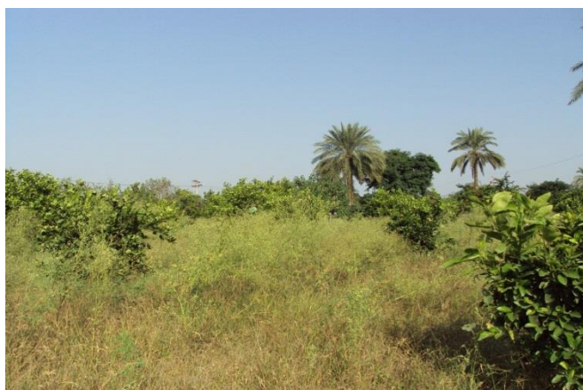
Fig. 3. Parthenium infested citrus orchard in Sargodha.

Further, it is proposed for future researchers that competition studies of parthenium with other crops such as sugarcane, cotton and vegetables should be conducted to ascertain their yield loss and to find out its critical density and competition period in them. Moreover, further allelopathic studies should be carried out with respect to various growing conditions of parthenium weed in response to other ecological factors such as temperature, light, pH, moisture and salts under laboratory conditions to validate its allelopathic behavior. Allelopathic potential of various crops, weeds and trees should be tested against parthenium weed to evaluate their bio-herbicidal activity against this weed. Liquid extracts of allelopathic plants A. aspera , A. philoxeroides , R. communis and Z. mauritiana should be tested alone or in combination with existing synthetic herbicides for sustainable management of parthenium in different crops. Being a highly allelopathic weed, phytotoxic compounds and extracts of parthenium should be evaluated for their herbicidal, insecticidal and anti-pathogenic properties.