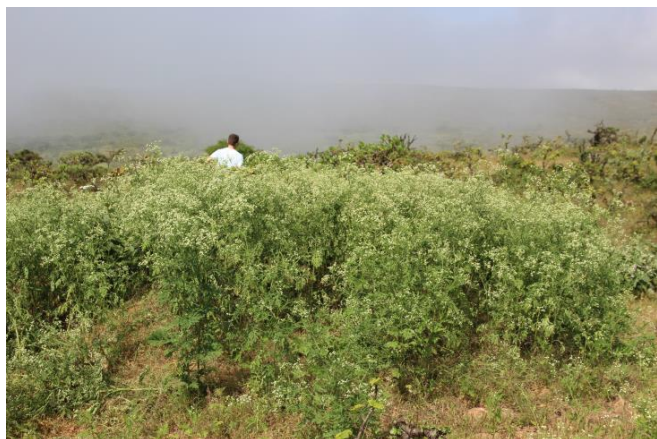
Fig. 2. Tall plants of P. hysterophorus forming thickets on the mist-affected plateau of Jabel Qamar (Dhofar mountains). Ras Shajr, 850 m. Photo © S.A. Ghazanfar, Sept. 2017.

Parthenium hysterophorus is unpalatable to goats, camels and cattle, flowers and seeds profusely, with the result that its spread is greatly accelerated. It has taken over large areas of the mist affected grasslands of the Dhofar mountains which has affected the abundance of several native species of annuals. For example, on my recent visit I observed that several common annuals such as Dyschoriste dalyi , Justicia diffusa , Heliotropium calcareum , Ipomoea dichora , I. turbinata , Boerhavia diffusa that were abundant and found commonly earlier were rarer and difficult to locate (pers. obs. 2017). As P. hysterophorus is taller than many of the annuals, its thick, tall habit limits light to the low dwelling species (Fig. 2). It produces allelopathic chemicals that prevent other plants from germinating and growing near it. In some parts of Jabel Qamar and in areas of Wadi Darbat, it appears to dominate the under storey in open woodland (Figs 3, 4, 5).