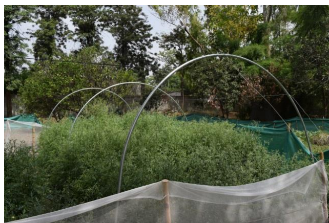
Fig. 1. Establishment of parthenium weed in a tunnel (above) and open field (below) at CABI -Rawalpindi, Pakistan.