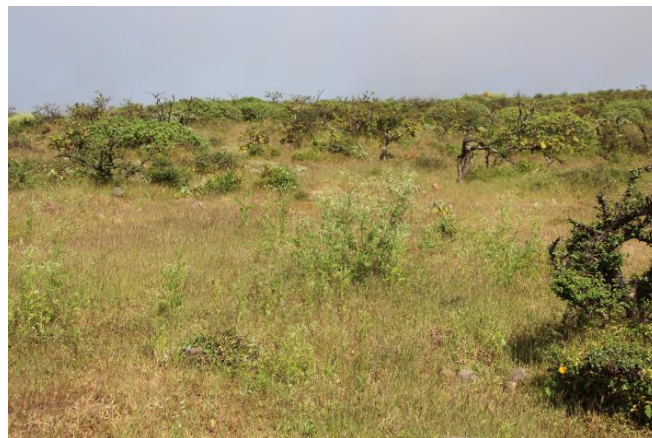
Fig. 3. Commiphora scrub on Jebel Qamar (Dhofar mountains) with P. hysterophorus in foreground. Ras Shajr, 850 m. Photo © S.A. Ghazanfar, Sept. 2017.