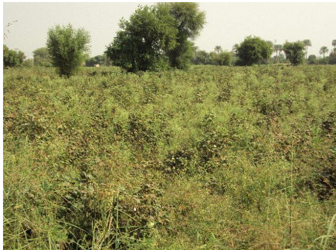
Fig. 2. Severe infestation of Parthenium in cotton field at Sargodha.

Economic thresholds of parthenium weed in maize crop through rectangular hyperbolic non-linear regression model were estimated to be 1.2 and 1.3 plants per m 2 during year 2012 and 2013, respectively. Herbicide screening field experiments revealed the highest parthenium weed control efficiency (100%) was achieved by bromoxynil + MCPA + metribuzin @ 470 g a.i. ha -1 followed by dicamba @ 304.5 g a.i. ha -1 (90 and 96.8%) during years 2012 and 2013, respectively. The best performance in terms of grain yield increase over weedy check was shown by the bromoxynil + MCPA + metribuzin @ 470 g a.i. ha -1 (138%) followed by dicamba @ 304.5 g a.i. ha -1 (74%). The highest benefit: cost ratio (6.87 in first year and 7.17 in second year) and marginal rate of return (2858 in first year and 2030 in second year) was attained by bromoxynil + MCPA + metribuzin @ 470 g a.i. ha -1 . It was therefore suggested that maize growers should use bromoxynil + MCPA + metribuzin @ 470 g a.i. ha -1 for the effective and economical control of parthenium weed in maize.