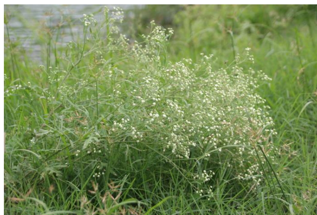
Fig. 5. Parthenium hysterophorus growing with grasses and other annuals. Wadi Darbat, Dhofar mountains, 650 m. Photo © S.A. Ghazanfar, Sept. 2017.