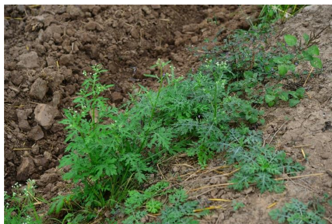
Fig. 2. Parthenium weed along the margins of crop field in Thailand.