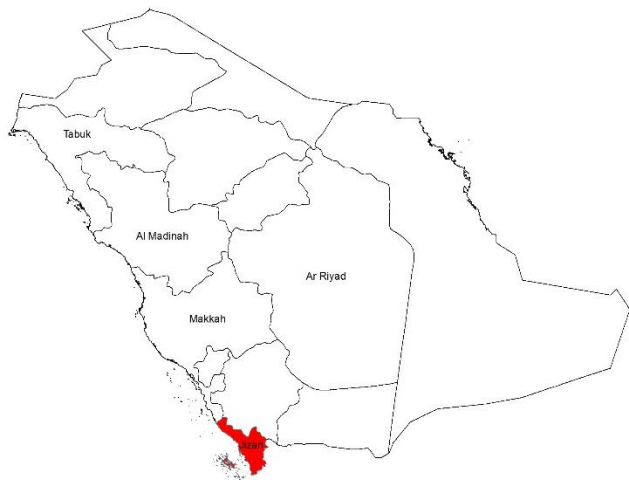
Fig. 1. Distribution of parthenium weed in the south-western parts (red) of the Kingdom of Saudi Arabia.

In East and South-East Asia, parthenium weed is reported from China, Taiwan, South Korea, Japan, Malaysia, Vietnam and the most recent addition is Thailand in 2016. Dr Siriporn Zungsontiporn (M. Day, Australia, personal communication) has discovered parthenium weed in Thailand in 2016 and her team members are attempting eradication. Keeping in view the devastating effects of this weed in the region, parthenium weed has been a quarantine weed in Thailand since 2008. The leadership of a surveillance program for parthenium weed was given to Dr Siriporn Zungsontiporn in 2011-2012. In 2016, parthenium weed detected in a vegetable and maize going area in Lamphoon Province, northern Thailand. The weed was sprayed with paraquat and removed and set to fire outside the field. Since the weed had set seed, a follow up eradication program is in progress.