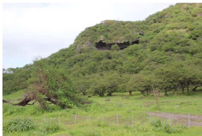
Fig. 4. Acacia-Delonix-Anogeissus deciduous woodland on Jebel Qara, Dhofar mountains. Wadi Darbat, 650 m. Photo © S.A. Ghazanfar, Sept. 2017.