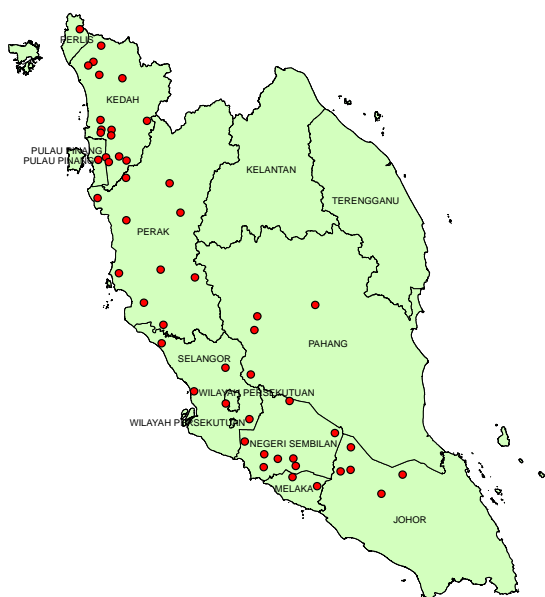
Fig. 1. Parthenium weed infestation in peninsular Malaysia (Red dots indicate the infested areas).

spread of this weed within the country. According to this act, any person found carrying the plant from one place to another without the permission of concerned authority is liable to a penalty of RM10,000 USD 2,500) or two year's imprisonment or both. Recently, the DOA has developed a Standard Operation Procedure (SOP) for controlling the spread of the weed, under which the people with parthenium infestation within his/her premises will be given the notice to control it or to take help from the nearby local Agricultural Office for its control. If no action is taken after giving two notices, he/she will be punished financially. The parthenium weed issue is now included in three different big agenda viz, management of invasive alien species (IAS), biocontrol of invasive weeds, and management of parthenium weed in Malaysia